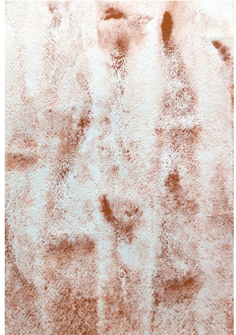
Dust stream Watercolour frottage on paper 20 x 30 cm