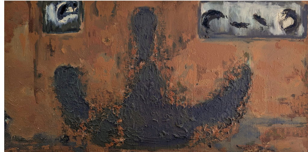
Corroded Crossbar Oil on canvas 119 x 61 cm